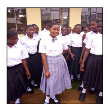
New school uniform for DMGS students