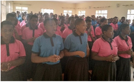
DMGS Student Assembly

DMGS, founded in 2014, provides a quality secondary school education including spiritual formation and safe boarding for 175 girls. DMGS students are free to discern a religious or non-religious vocation. There is an urgent need to educate girls in Tanzania because most girls are not educated beyond elementary school. Young African girls are hope for the future of families and communities as good mothers and good leaders. Empowering young women through education and spiritual formation has been proven to help break the cycle of poverty in Africa.