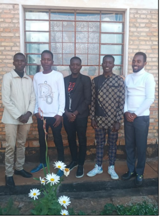
STLFO 2023 College Grads